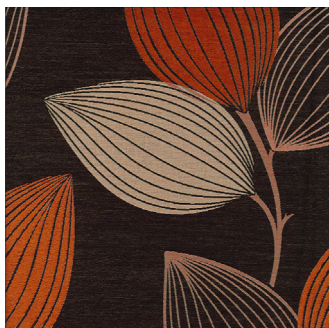
Maurice Kain WOODLANDS TWIST