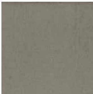
Maurice Kain AFFINITY TEMPO