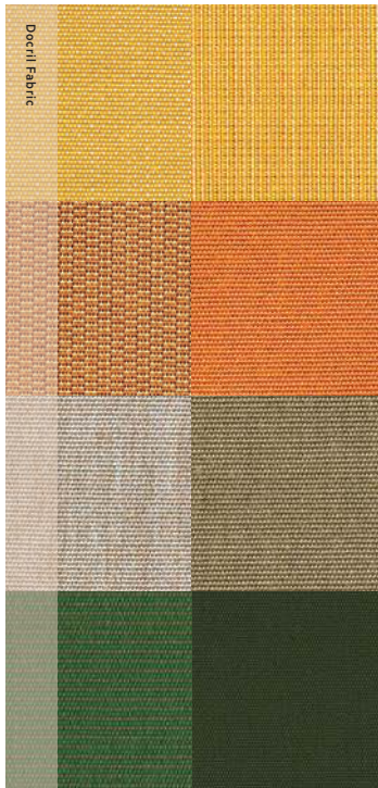
Docril offers an impressive selection of 132 vibrant colours to suit any décor and comes with a 10 year UV warranty.