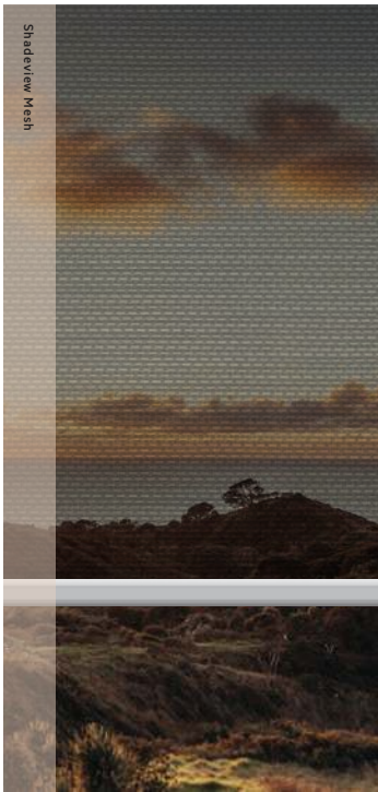
Shadeview fabric cleverly diffuses light, lends a pared-back finish and optimises views but it still protects you and your home from the elements. Available in different weave options with 25 colours.